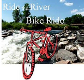
Ride the River Bike Ride