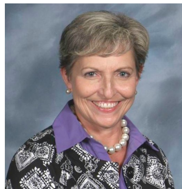
Linda Olsen - Minister of Parish Education

Our prayer for you is that you will choose to make a faith difference in your child!