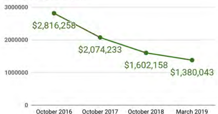
Mortgage Balance Reduction

After the first of the year, we continue by the grace of God, to MARCH toward a strong finish in our Arise! Campaign, getting us closer to eliminating our property debt.